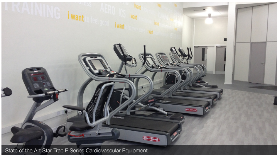
State of the Art Star Trac E Series Cardiovascular Equipment

With the recent merging of several smaller colleges to form City of Glasgow, the college had planned to combine the old equipment from their 3 existing locations into one new facility. After various meetings and site visits, Anytime Leisure provided drawings to show how the new facility could look in various scenarios which the college had been considering. One design also outlined how the facility would look with a selection of premium quality new equipment. The college then considered the options set out for them and opted to open the facility with a full range of brand new fitness equipment.