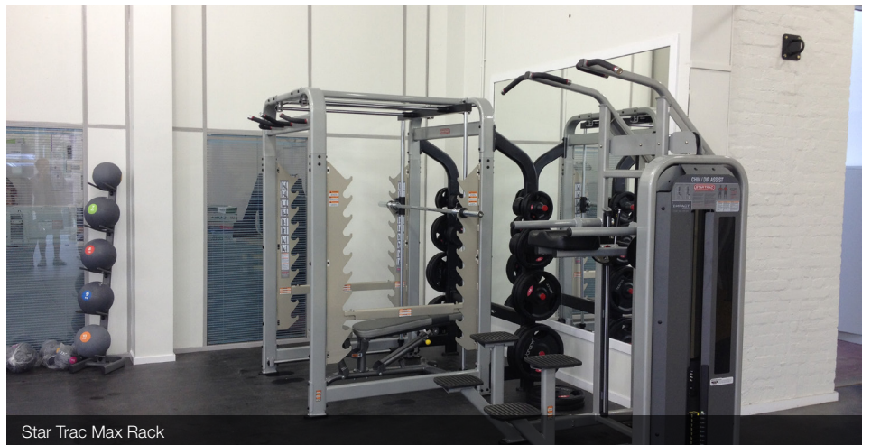
Star Trac Max Rack

The new equipment for the site was grouped in areas dedicated to functional, free weight, CV and fixed resistance training. Each of these consisted of premium products from some of the fitness industry's top brands, such as Cybex and Star Trac cardio equipment, Impulse and Human Sport fixed resistance machines and Jordan functional equipment.