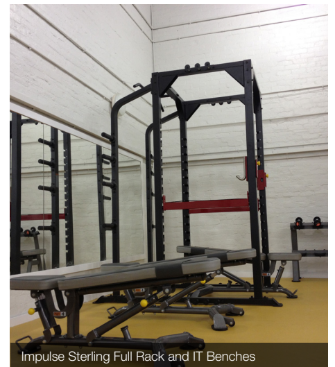
Impulse Sterling Full Rack and IT Benches