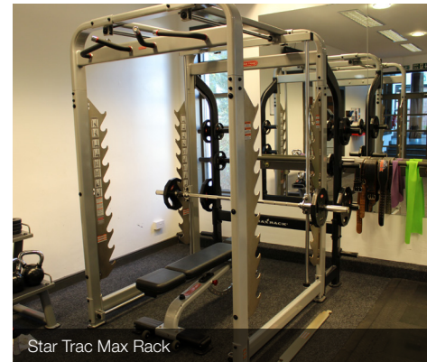
Star Trac Max Rack